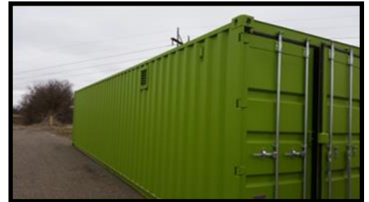
Sample of permanent HHW site container

Providing HHW collections is one of the region's most important recycling goals.