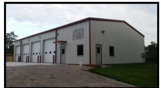
Maitland Fire building, 2012 CDBG project