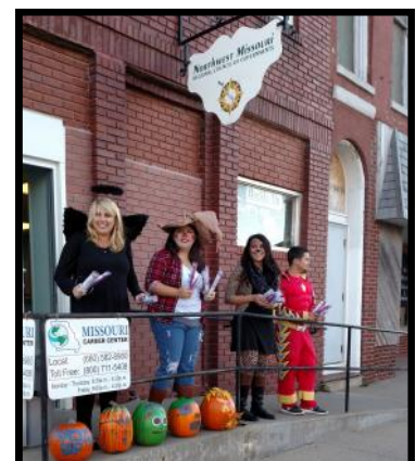
Downtown Trick-or-Treat, 2015, funded by a Blueprint for Roadway Safety grant