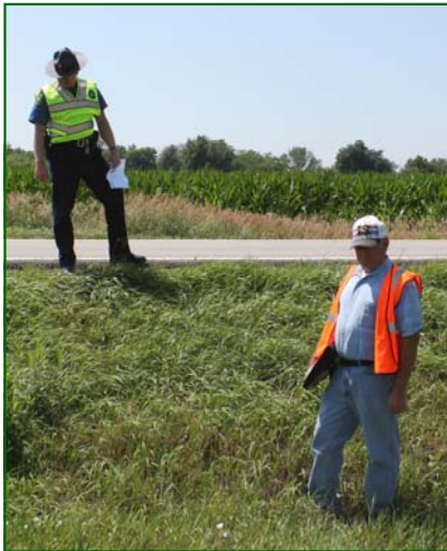
RSA committee members inspect the site of one accident on Route A.