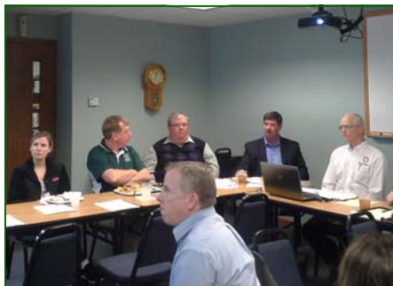
April's RTPT meeting reviewed the draft Broadband Plan which identifies issues and gaps in coverage.

The State of Missouri utilized the information gathered by NWMORCOG and the other eighteen regional planning commissions to develop a state broadband plan. The RTPT was