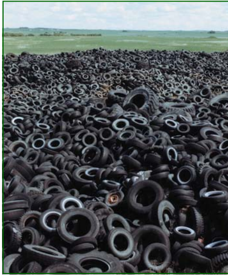
In spite of their local popularity, tire collections can no longer be sponsored by the Solid Waste Management District on the local level.

The waste tire program currently operated by the State has a 500 tire minimum that is not compatible with the small city populations of this rural area. The current program is fully booked through 2014, with funding scheduled to sunset in 2015. At this time, the Regional Council is looking for other ways to fund future tire collections, but hope that when the current program ends, we may once